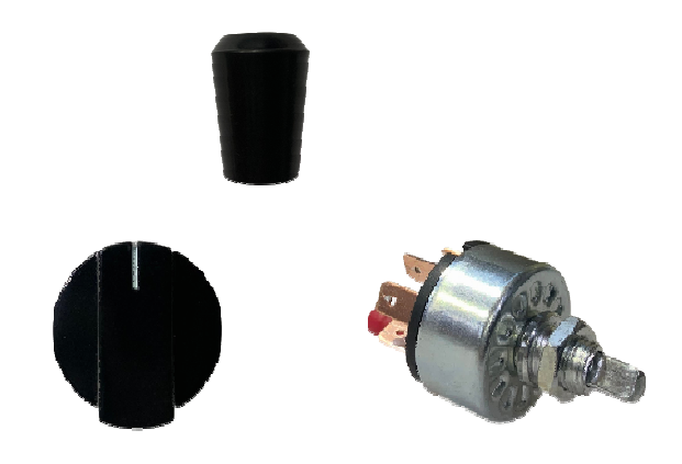
Part # 23901