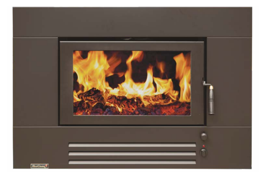
Series 7: I-600 Inbuilt Woodheater Charcoal