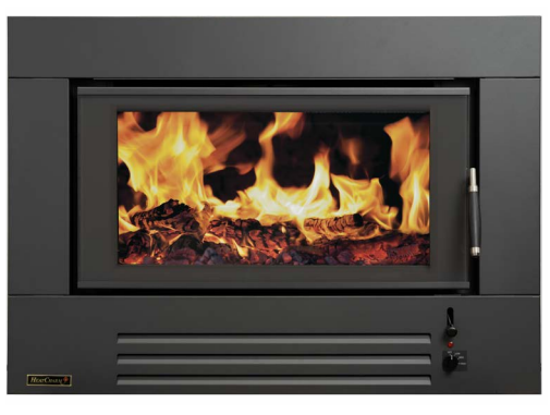
The Series 8 I -600 Inbuilt Woodheater with its sleek design and wider Glass Door pictured in Charcoal.

Our inbuilt Series 8 is a sleek design with a wider Glass Door which comes in a Matt Black or Charcoal painted finish. Heatcharm woodheaters are beautifully engineered and will set your senses soaring. Choose the woodheater with a difference.