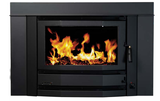
Inbuilt Port Phillip Bay Window Woodheater Matt Black

6 Inbuilt Woodheater Styles to Choose From