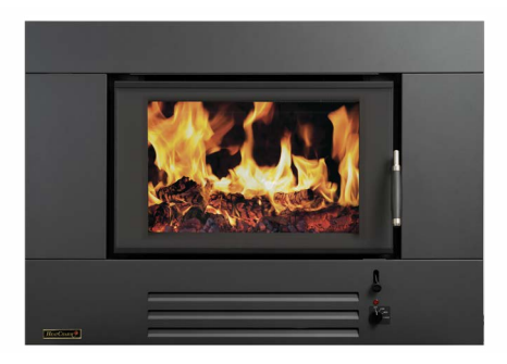
Series 8: I-500 Inbuilt Woodheater Charcoal