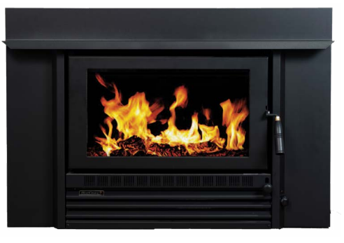
Series 5: I-600 Inbuilt Woodheater Matt Black Also available in a 830mm wide cut down