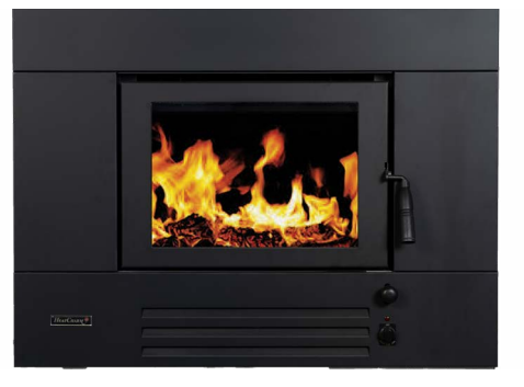
Series 7: I-500 Inbuilt Woodheater Matt Black