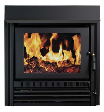
Series 5: I-500 Inbuilt Woodheater Cut Down Matt Black Size 702 mm wide